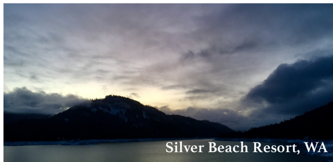
Silver Beach Resort, WA